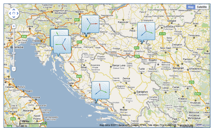
Fig. 6 WAMSTER network of PMU devices for Croatian CARWAM project