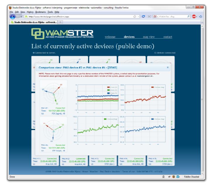
Fig. 4. Synchronized comparison of two PMU devices, in real time