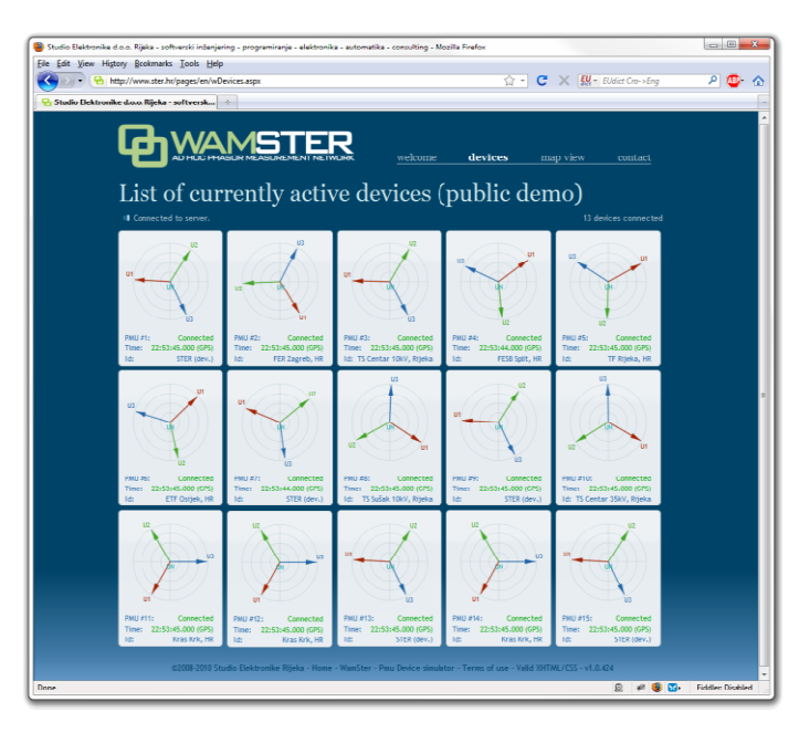
Fig. 3. Web browser showing the Wamster demo page.

Using wired communication links, STER PMU units can also act as stand-alone synchrophasor data sources, independent from the Wamster server, and integrate directly into existing systems.