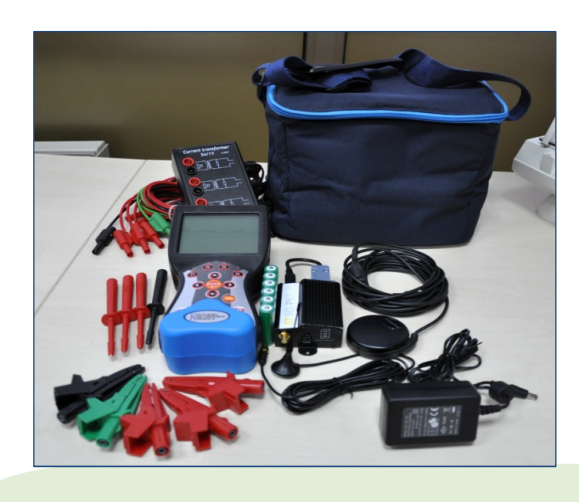
Fig. 1. STER PMU with all accessories. Only a single power supply adapter is needed.

With its rechargeable battery and flash memory sufficient for storing 2 hours of 4-phase synchrophasor data (at full reporting speed, 60Hz), all important measurements will be preserved.